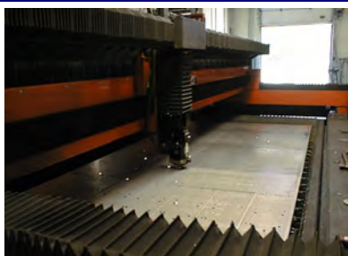
BYSTRONIC 3000WATT ROTARY AXIS LASER

SHEET METAL • MACHINING • WELDING & BRAZING LASER CUTTING • ENCLOSURES • POLISHING